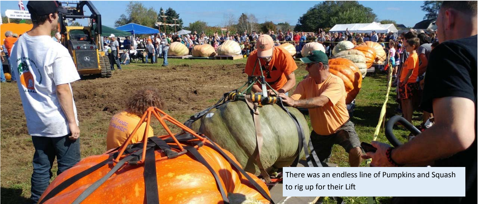
There was an endless line of Pumpkins and Squash to rig up for their Lift