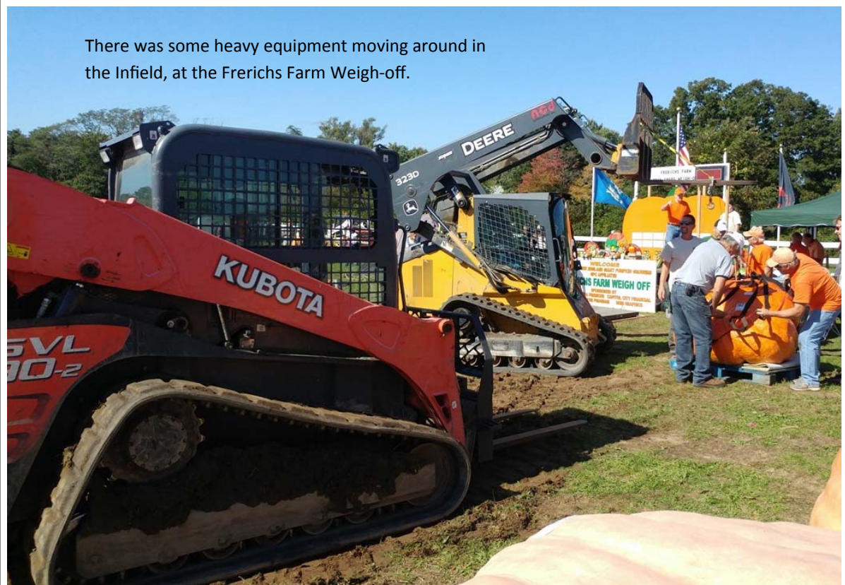
There was some heavy equipment moving around in the Infield, at the Frerichs Farm Weigh-off.